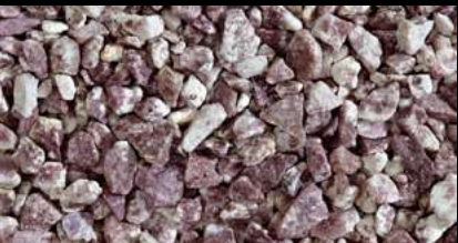
Mica Granite Violet