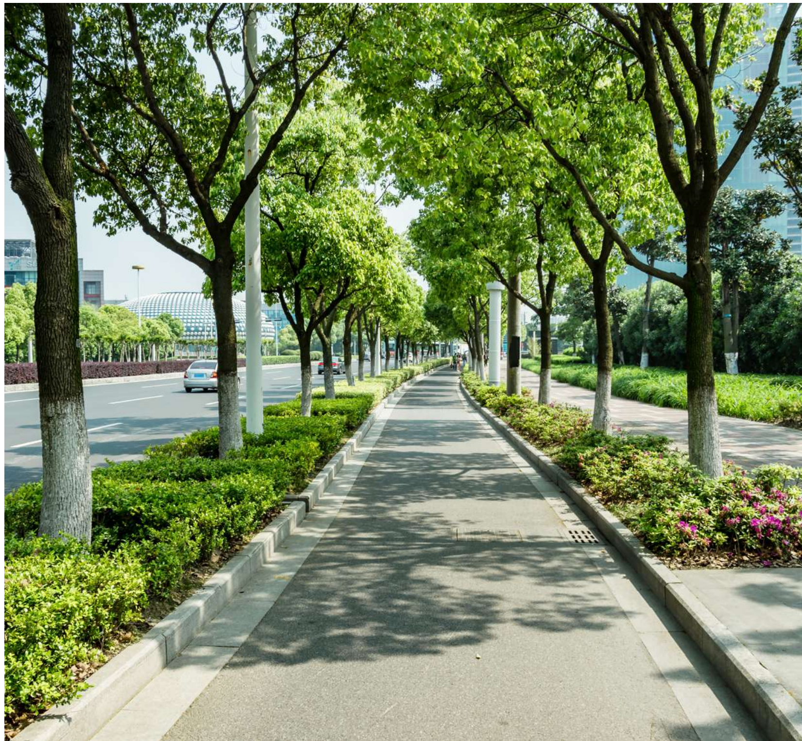
Cycle-pedestrian walk in washed stone