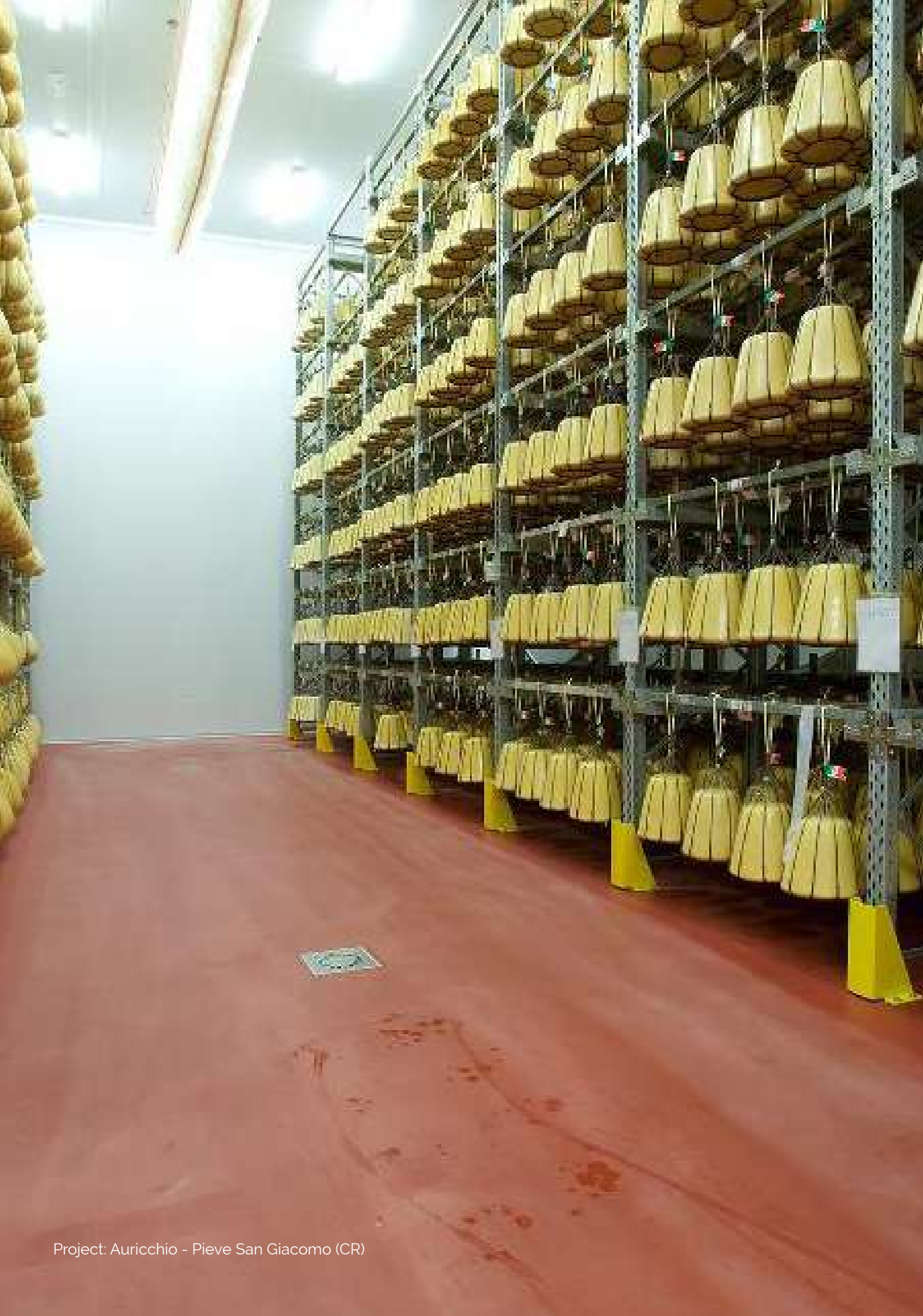
Project: Auricchio - Pieve San Giacomo (CR)